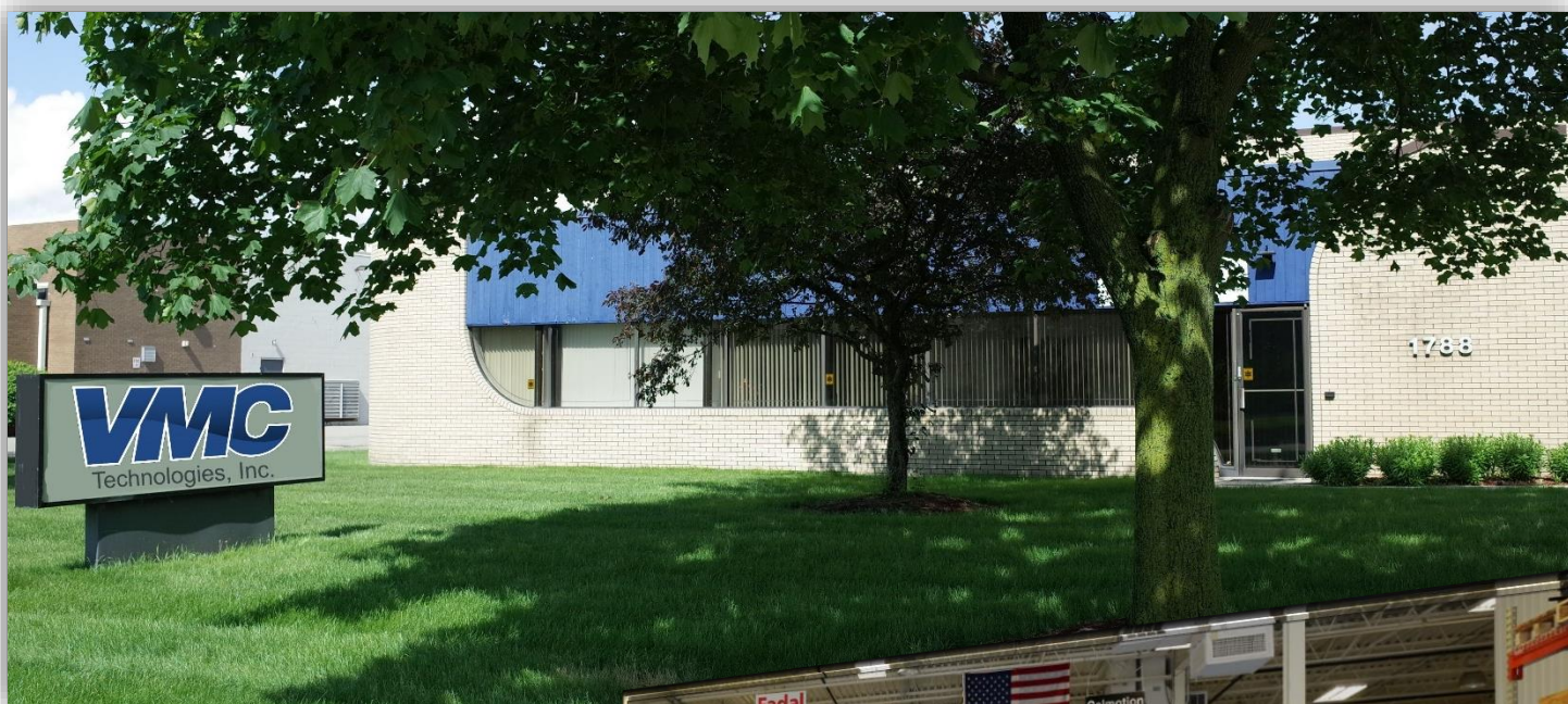
Pictured Above: VMC Tech Building Front Exterior

Come visit our SHOWROOM! . . . . . No commitment. No Pressure. We have machines here ready for you to come view or demo and we look forward to meeting you!