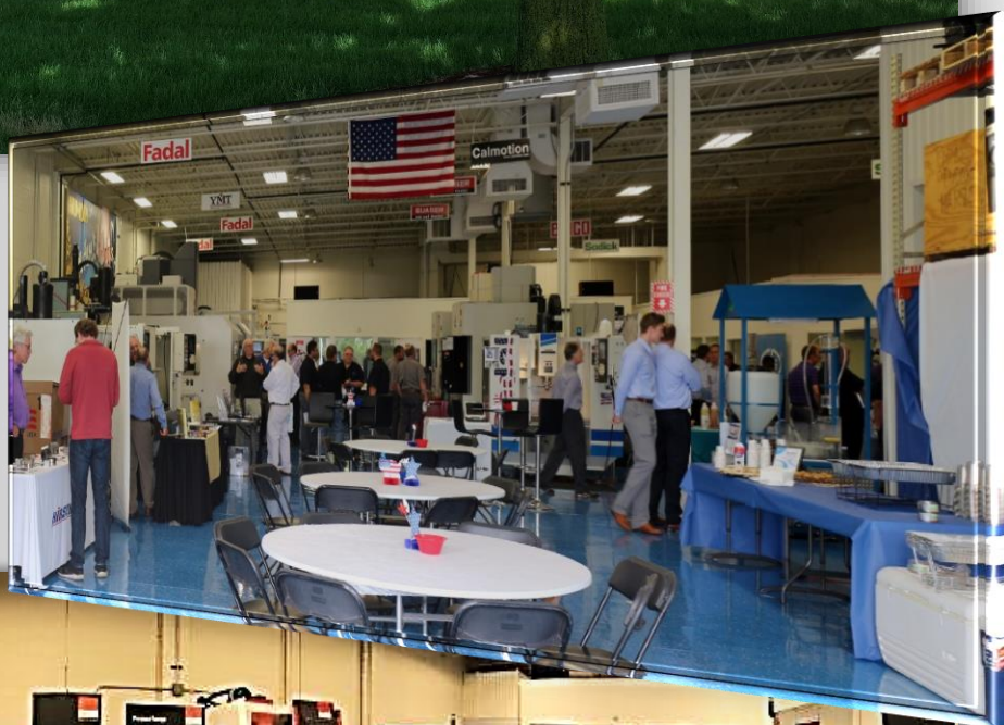
Pictured Below: VMC/Emco Showroom